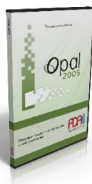
Opal 2005 – Software for Consolidation of Financial Statements