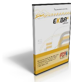
Equa – Compares Financial Reports and Trial balances