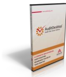
AuditDesktop – Auditing software