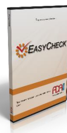
EasyCheck FMCS – Financial Management and Control System