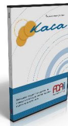
Cashbook – Cashbook