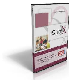
Opal X – Software for Consolidation of Trial balances