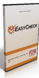
EasyCheck – Business management system