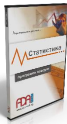
Statistics – Hospital statistics (developed for one of our clients)