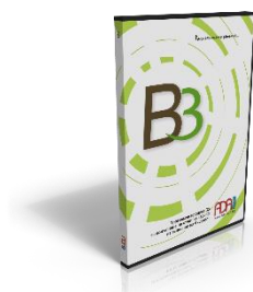
Sipter(i) – Enterprise Resource Planning System (ERP)